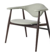
Smoked Oak finish