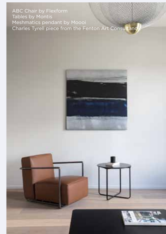
ABC Chair by Flexform Tables by Montis Meshmatics pendant by Moooi Charles Tyrell piece from the Fenton Art Consultancy

The second is a two-bedroom apartment with a view of the town and a terrace overlooking the garden. The kitchen is long and low in Pawson style, with a smoked mirrored area entering the living room. Before you get through this mirrored area there is a L'Invisible door into a utility room that one barely notices.