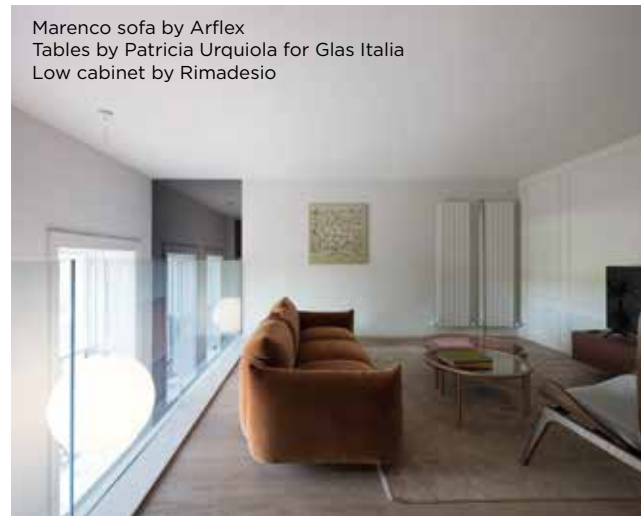
Marengo sofa by Arflex Tables by Patricia Urquiola for Glas Italia Low cabinet by Rimadesio

The apartments are on sale through Savills with more show apartments coming soon.