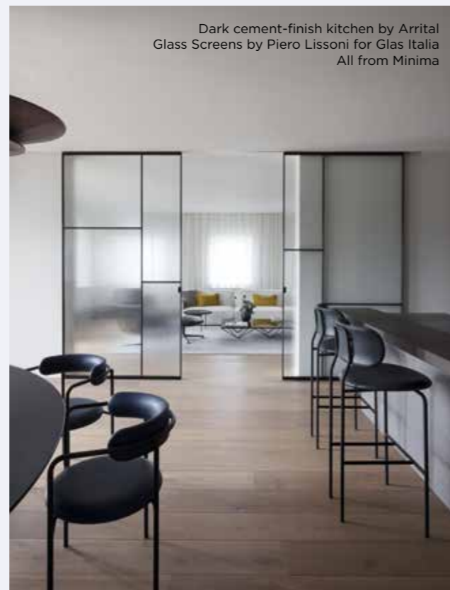
Dark cement-finish kitchen by Arrital Glass Screens by Piero Lissoni for Glas Italia All from Minima

Modern Kinsale is a bustling port and marina. The vibrant town with its culturally diverse community is at the southern end of the Wild Atlantic Way and has become renowned as one of Ireland's premier seafood destinations, with award winning restaurants Bastion and The Black Pig standing out for particular mention. The streets are lined with interesting galleries, hotels, restaurants and shops.