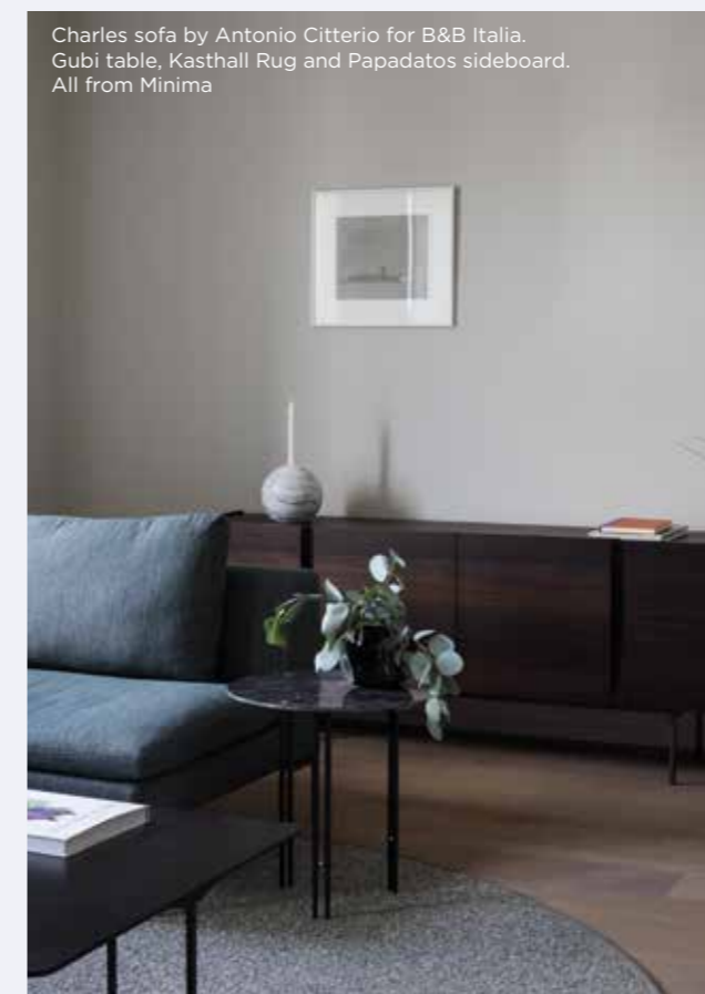
Charles sofa by Antonio Citterio for B&B Italia. Gubi table, Kasthall Rug and Papadatos sideboard. All from Minima