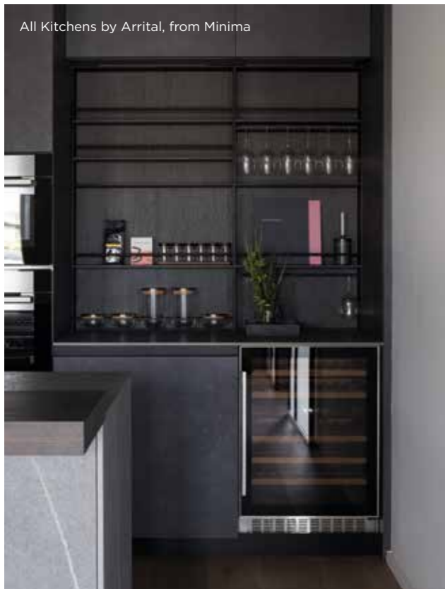
All Kitchens by Arrital, from Minima