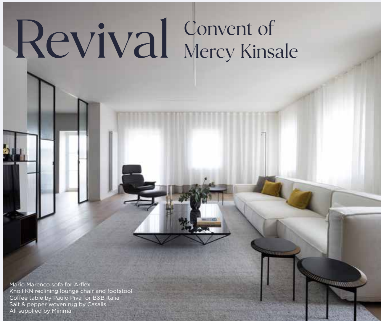
Mario Marengo sofa for Arflex Knoll KN reclining lounge chair and footstool Coffee table by Paulo Piva for B&B Italia Salt & pepper woven rug by Casalis All supplied by Minima