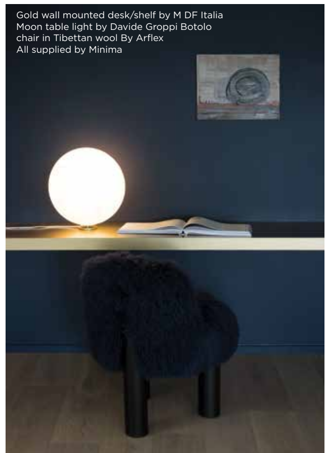
Gold wall mounted desk/shelf by M DF Italia Moon table light by Davide Groppi Botolo chair in Tibetan wool By Arflex All supplied by Minima

www.minimahome.com www.jca.ie www.fentonartconsultancy.com www.savills.ie