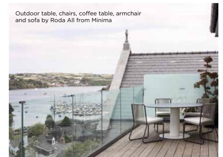
Outdoor table, chairs, coffee table, armchair and sofa by Roda All from Minima

This apartment sold immediately; there are more similar.