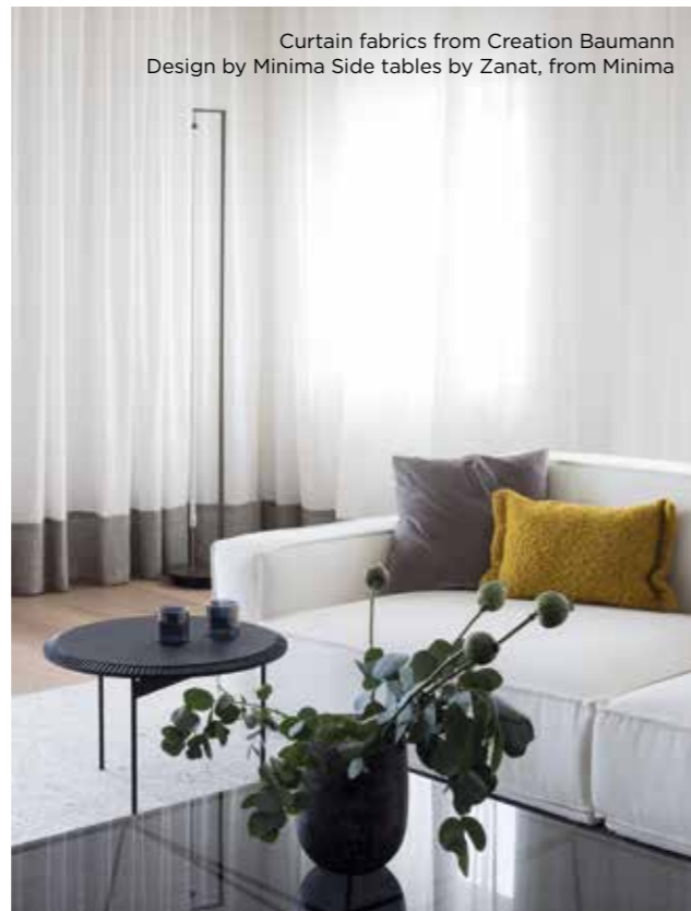
Curtain fabrics from Creation Baumann Design by Minima Side tables by Zanat, from Minima