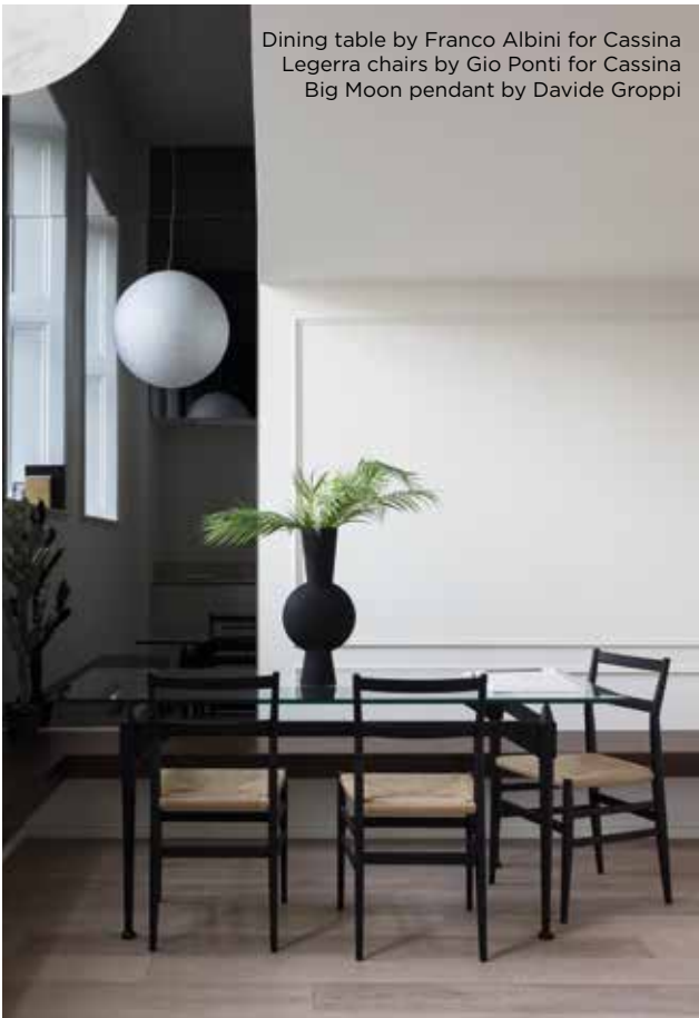
Dining table by Franco Albini for Cassina Leggera chairs by Gio Ponti for Cassina Big Moon pendant by Davide Groppi

The third apartment has two bedrooms across two floors with a view over the town and gardens. With a nod to the current fifties to seventies revival, Helen has styled this duplex is styled as a younger fun apartment. The original room had ceilings over five metres tall with tall sash windows so it became a split level. In the upper living area that looks down on the dining area she used a large Moon light from Davide Groppi which can be seen from the streets below.