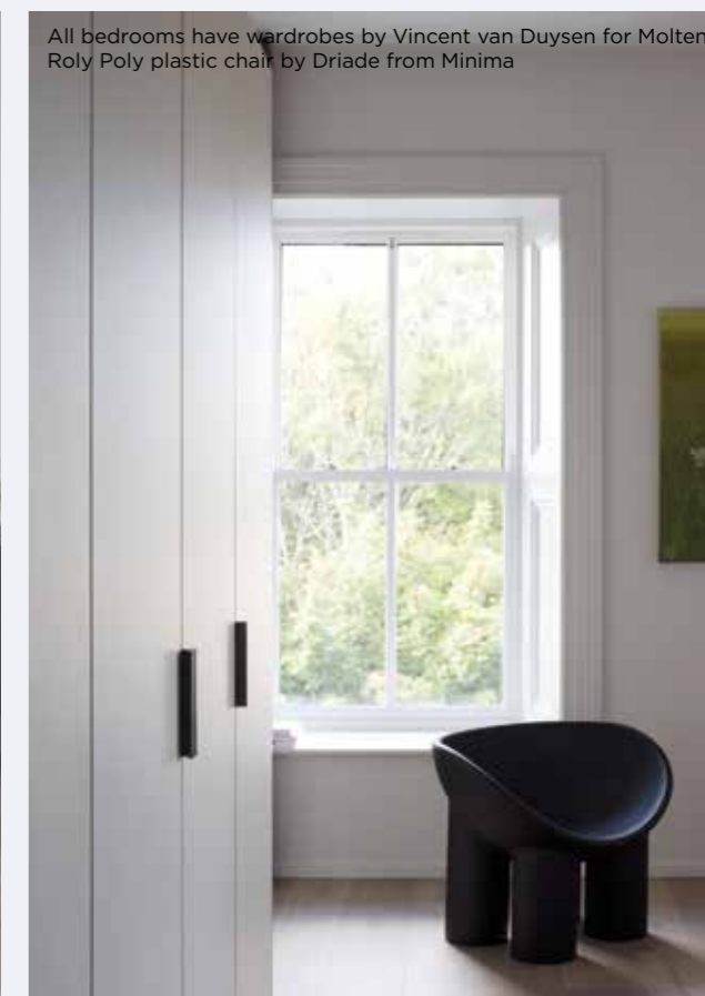
All bedrooms have wardrobes by Vincent van Duysen for Molteni Roly Poly plastic chair by Driade from Minima